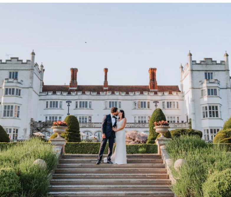
Danesfield House Hotel and Spa

Whatever the occasion, be it a wedding, civil partnership, renewal of vows or a naming ceremony, Buckinghamshire is sure to offer a location to suit you, your family and friends. You could choose a small intimate venue in a tiny hamlet or a grand stately home or manor house with sweeping grounds and ornate gardens steeped in history. Buckinghamshire is a county of contrasts with an abundance of history and heritage, culture and countryside.