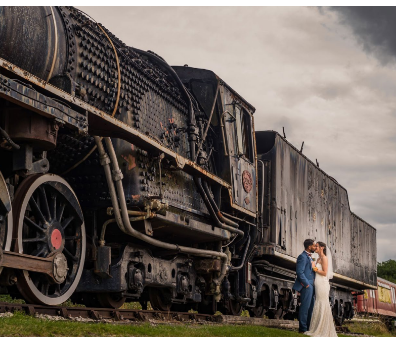
Buckinghamshire Railway Centre