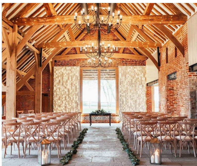
Rackleys Chiltern Hills